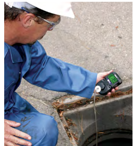
QRAE II Pump being used for a confined space entry

SPE O 2 ™ sensor designed to meet RoHS directive